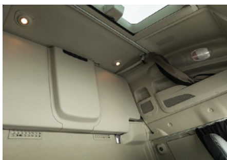
Stralis X-Way Sleeper Cab interior