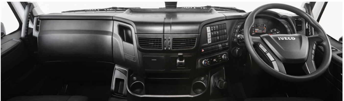
Stralis X-Way AT Prime Mover interior