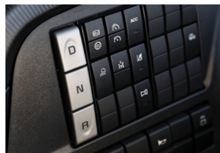
Stralis X-Way instrument panel