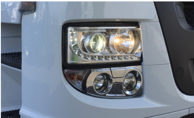
Xenon headlight + Headlamp washers