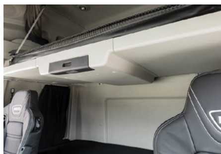
Stralis X-Way Sleeper Cab interior