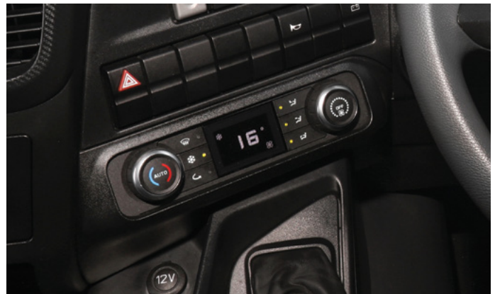
Auto a/c system