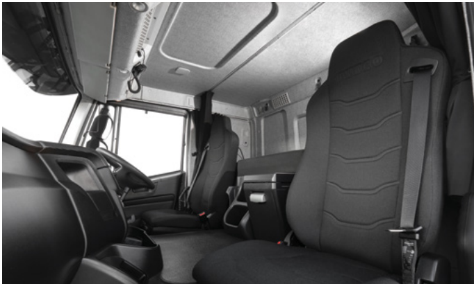
Stralis X-Way AT Prime Mover interior