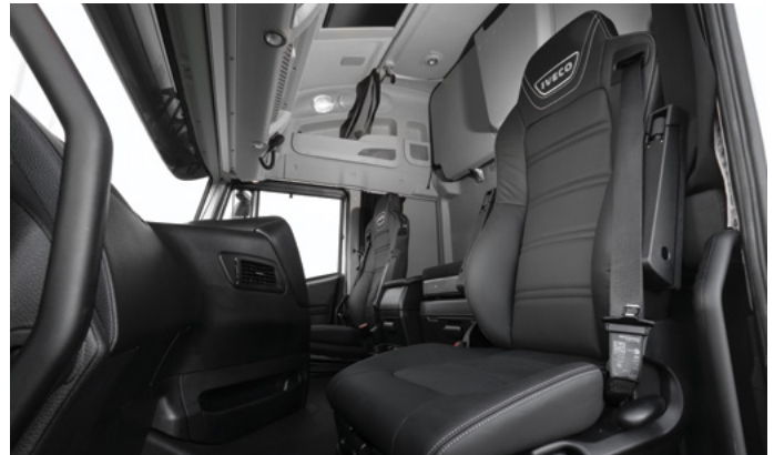
Stralis X-Way AS Prime Mover interior